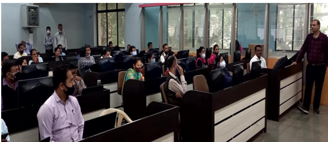
The Resource Person during the interaction with the participants